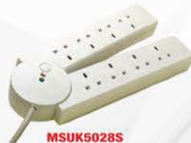
MSUK5028S 13 Amp BS Socket