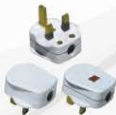
MS9528 / MS9528L