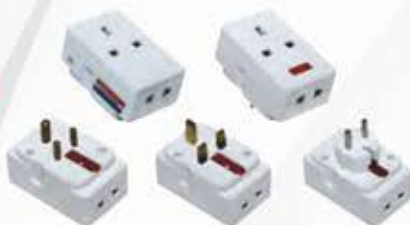
MS1927 MS1928 MS1929 MS1927L MS1928L MS1929L