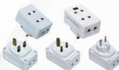
MS1924 / MS1925 / MS1926 MS1924L / MS1925L / MS1926L