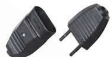
MS343B / MS343A