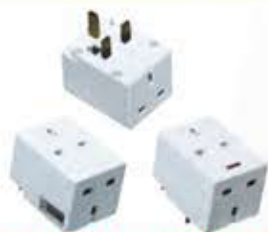
MSN1928 / MSN1928L