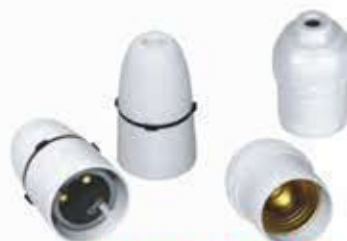
MS210C / MS210E