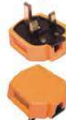
MS9548 / MS9548L