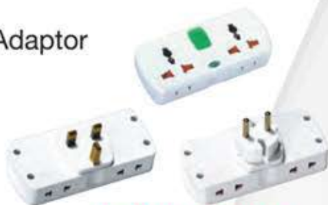
MS024UK / MS024G