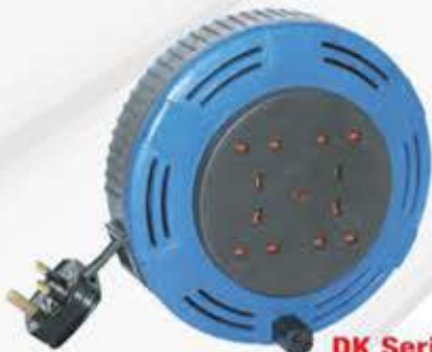
DK Series (10-15 Meters)