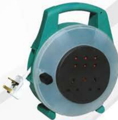
MSH Series (5-10 Meters)