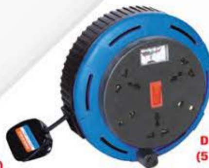
DK Series (5 Meters)