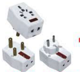
MS7196 / MS7296 MS7196L / MS7296L