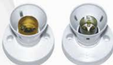
MS230E / MS230B