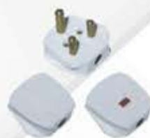
MSV6615 / MSV6615L