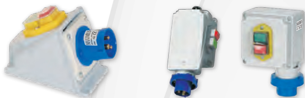
Art. CP MR2122

Switch Starter with minimum tension coil