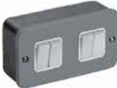
10Amp 4 Gang 1 Way Switch MXMC217