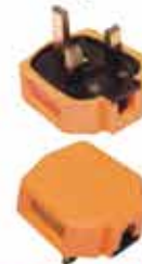
MS9548 / MS9548L