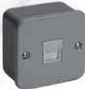
Tel./ Data Socket MXMC245