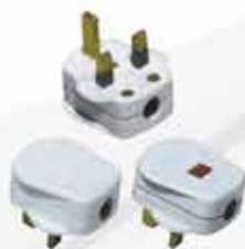
MS9528 / MS9528L