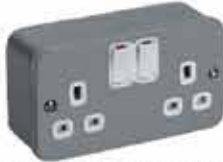
13Amp Double Switch Socket MXMC231