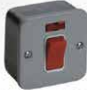
45Amp DP Switch With Neon MXMC224