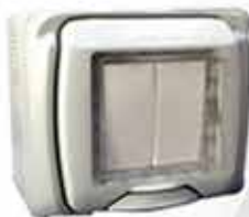
16Amp 2 gang 1 way MMG 4003 16Amp 2 gang 2 way MMG 4004