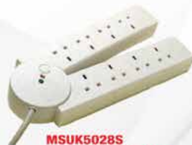
MSUK5028S 13 Amp BS Socket