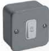
Bell Switch MXMC221