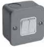
10Amp 2 Gang 1 Way Switch MXMC213