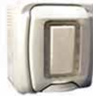
20Amp DP Switch With Neon MMG 4009