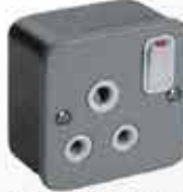
15Amp Switch Socket MXMC237