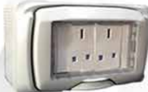
13Amp Switch Socket Double MMG4013