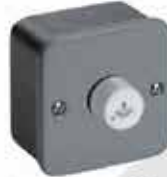
Lamp Dimmer 500w MXMC251