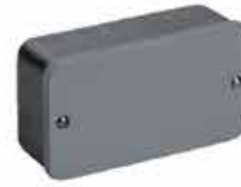
50mm 2 gang Box with Knockout MXMC250