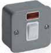
20Amp DP Switch With Neon MXMC222