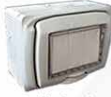
16Amp 3 gang 1 way MMG 4005 16Amp 3 gang 2 way MMG 4006