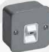
Sat. Socket Single MXMC239