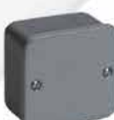
50mm 1 gang Box with Knockout MXMC249