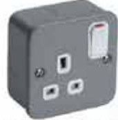
13Amp Single Switch Socket MXMC230