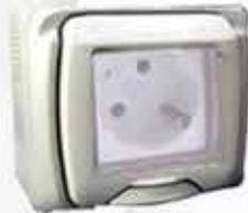
16Amp Schuko Socket with Switch MMG4012