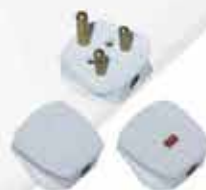
MSV6615 / MSV6615L