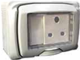
15Amp Switch Socket MMG4015