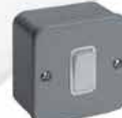
10 Amp Intermediate Switch MXMC255