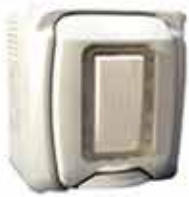
16Amp 1 gang 1 way MMG 4001 16Amp 1 gang 2 way MMG 4002