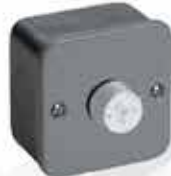
Fan Control Single MXMC252