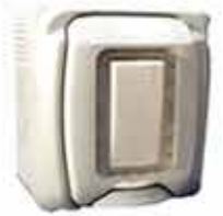
Bell Push MMG 4007