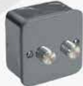
Fan Control Double MXMC253