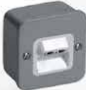
Sat. Socket Double MXMC240