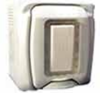
20Amp DP Switch Without Neon MMG 4008