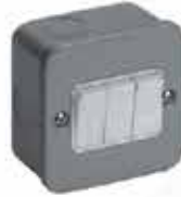
10Amp 3 Gang 1 Way Switch MXMC215