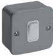
10Amp 1 Gang 1 Way Switch MXMC211