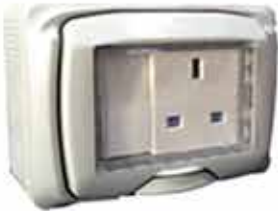
13Amp Switch Socket MMG4010