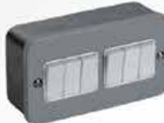
10Amp 6 Gang 1 Way Switch MXMC219