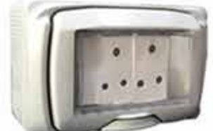
15Amp Switch Socket Double MMG4014