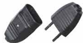
MS343B / MS343A